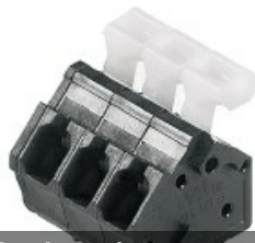
Product picture Similar to illustration