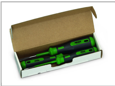
BSet of operating tools in a box

Subject to changes. Please also observe the further product documentation!