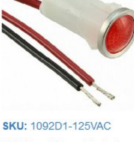
SKU: 1092D1-125VAC LED Panel Mount Indicator Red .500" Semi-Dome

Wire Leads Panel Mount Indicator, 1092 Series