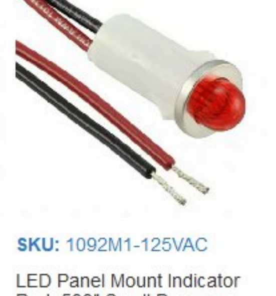
Red .500" Small Dome 125VAC Wire Leads Panel Mount Indicator, 1092

125VAC Wire Leads Panel Mount Indicators, LED Panel Mount Indicators, LED Panel Mount Indicators, LED Panel Mount Indicator, 1092 Series