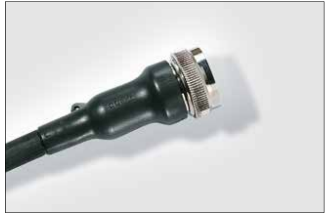
150 Series boot recovered onto a connectors.