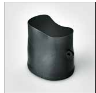
150 Series supplied.