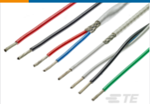
TE Part #067883-000 44A7995-20-4CS2540