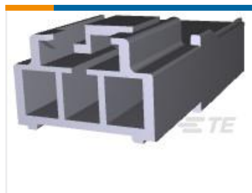
TE Part #176283-4 AMP UNIVERSAL POWER CAP 3P