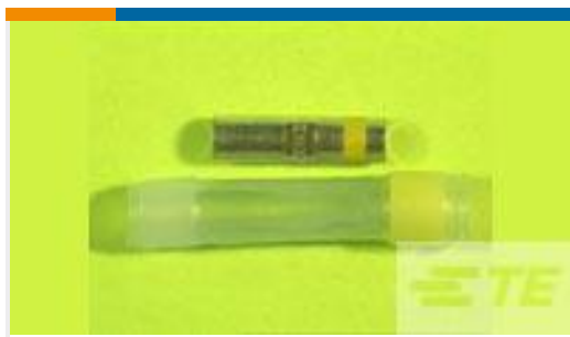
TE Part # 650076-000 D-436-38