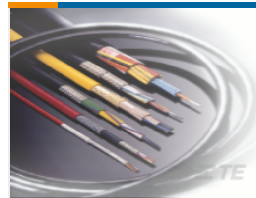
TE Part #2104733001 100G0111-0.75-0CK0042