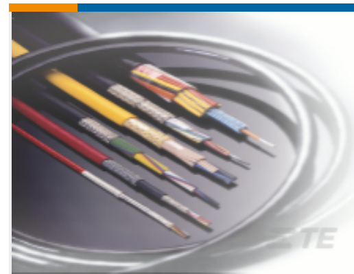
TE Part #9567093001 100G1121-0.5-0/9-0CK0042