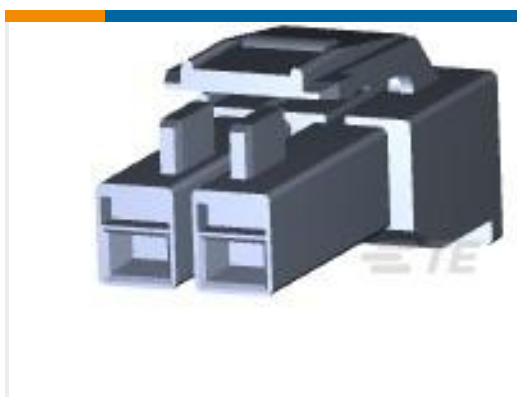
TE Part #176271-2 AMP UNIVERSAL POWER PLUG 2P