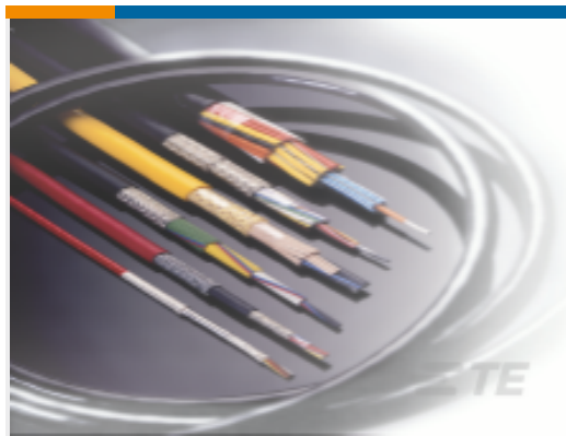
TE Part #9080653001 100G0121-0.50-0/9CK0042