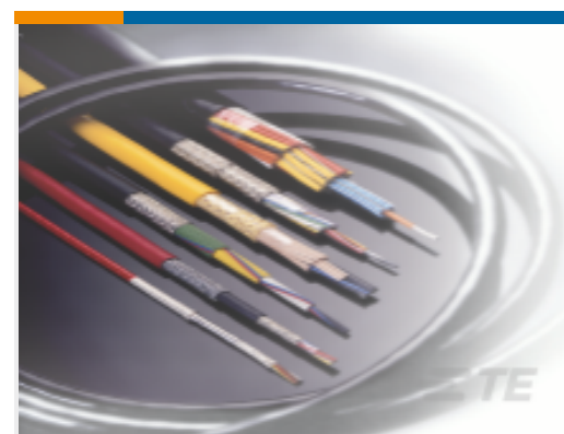
TE Part #9124733001 100G0111-1.00-0CK0042