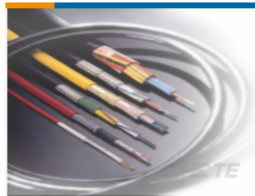
TE Part #9304773001 100G0111-2.00-0CK0042