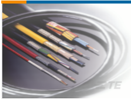
TE Part #CQ17743001 100G0111-1.50-9CK0226