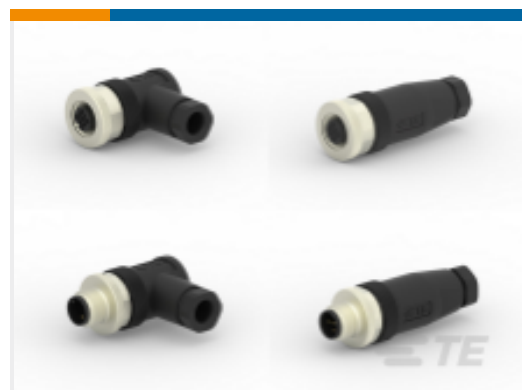
TE Part #T4110001051-000 M12 Field Installable Unshielded