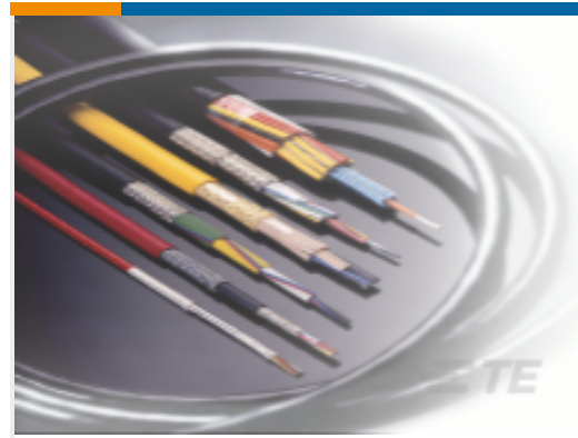
TE Part #CQ26833001 100G0111-1.00-9CK0226/5