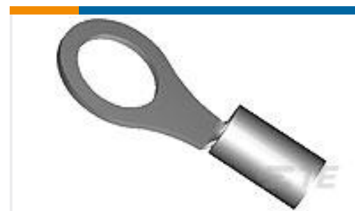
TE Part #321895 SOLIS R HT 22-16COMM22-18MIL 8