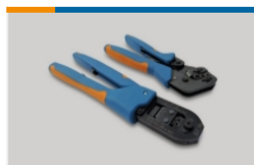
Portable Crimp Tools(33)