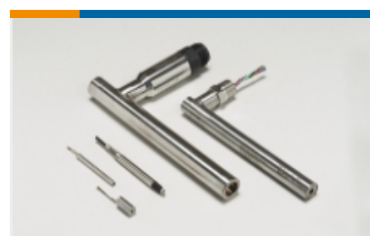
Linear Position Sensors - LVDT/LVIT(1)