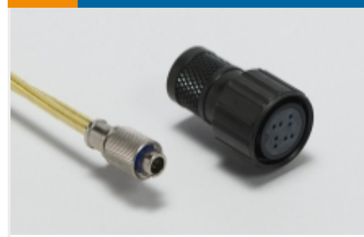
Standard Circular Connectors(528)