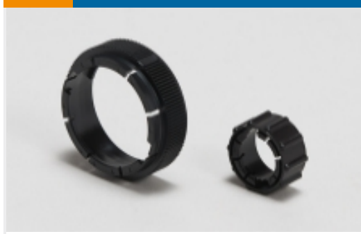
Circular Connector Adapters(2)