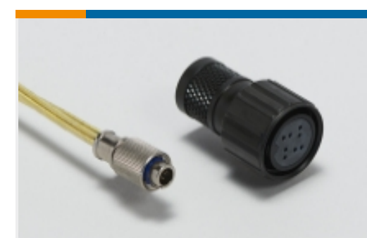
Standard Circular Connectors(14)