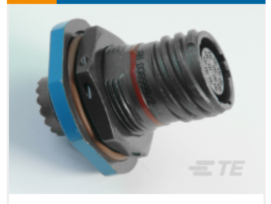
TE Model / Part #YDTS24F17-26BNV001 RECP ASSY