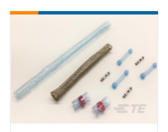
TE Model / Part #CR9761-000 D-200-0231-SF-C