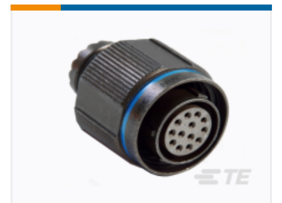
TE Model / Part #YDTS26F25-37BBV001 PLUG ASSY