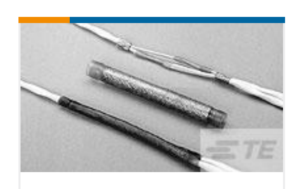
TE Model / Part #CM0967-000 D-150-0348