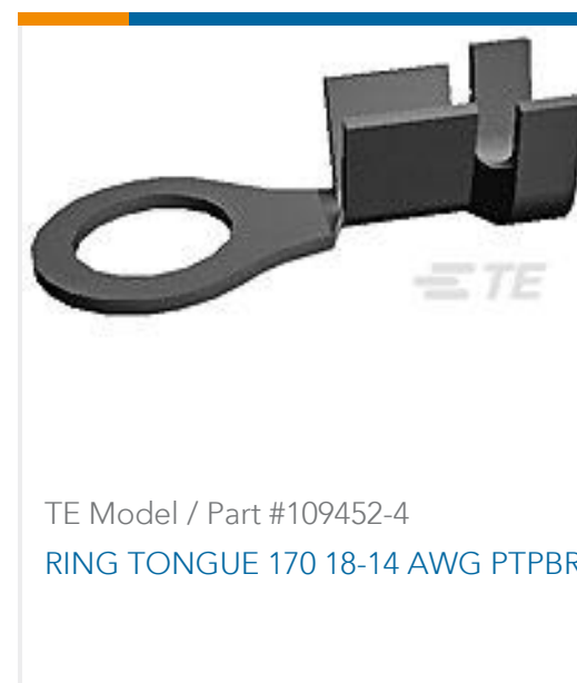
TE Model / Part #109452-4 RING TONGUE 170 18-14 AWG PTPBR