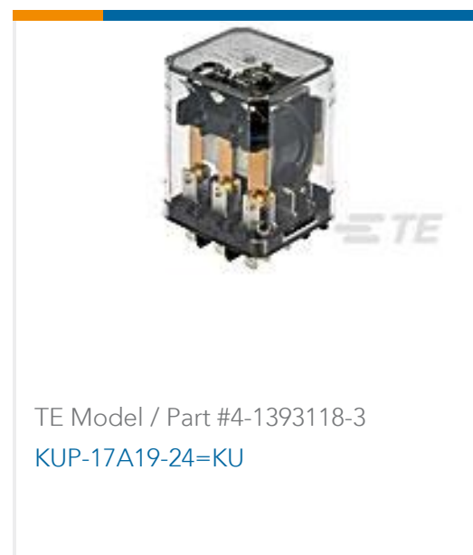
TE Model / Part #4-1393118-3 KUP-17A19-24=KU