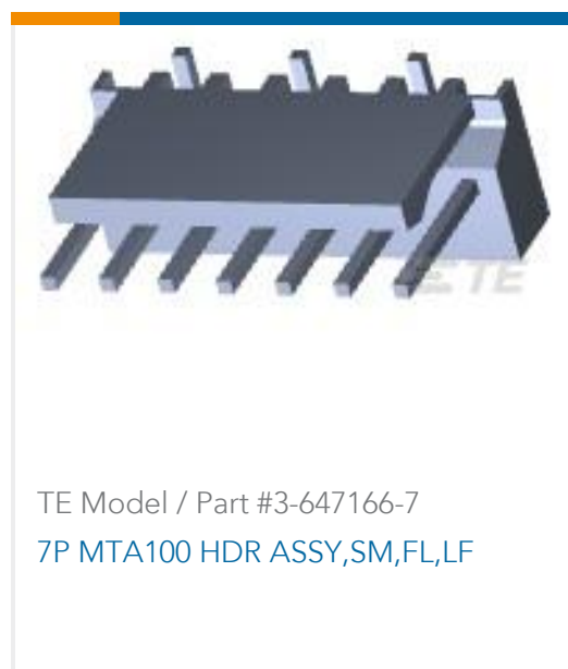
TE Model / Part #3-647166-7 7P MTA100 HDR ASSY,SM,FL,LF