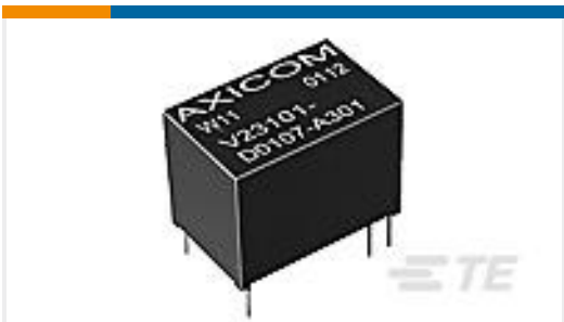
TE Model / Part #3-1393779-2 V23101D 106A201