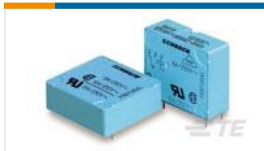
TE Model / Part #8-1393215-1 V23057-B0006-A201