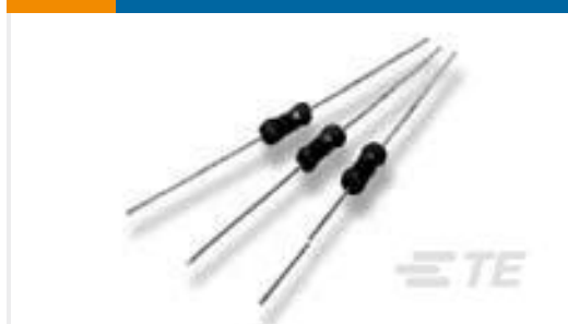
TE Model / Part #4-1625892-5 3W SM M/OX 5% 39K