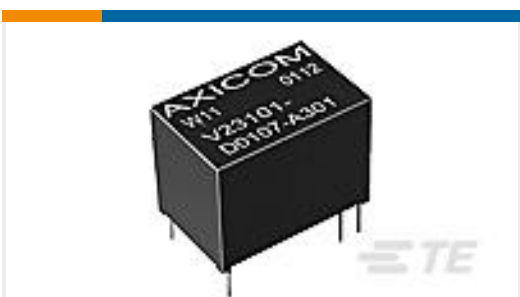
TE Model / Part #1-1393779-6 V23101D 6B201