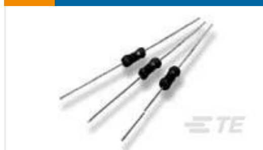
TE Model / Part #5-1625892-9 3W SM M/OX 5% 56K