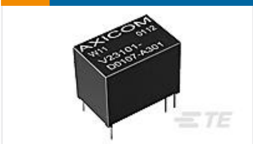
TE Model / Part #1-1393779-3 V23101D 6A201