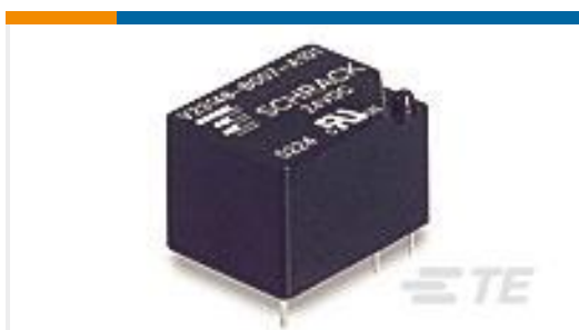
TE Model / Part #3-1393203-1 V23148-A1107-A101