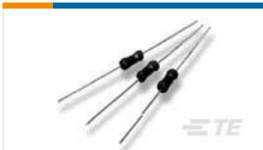
TE Model / Part #3-1625892-5 3W SM M/OX 5% 27K