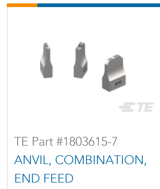
TE Part #1803615-7 ANVIL, COMBINATION, END FEED