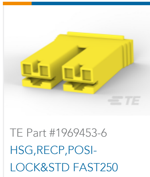
TE Part #1969453-6 HSG, RECP, POSI- LOCK&STD FAST250