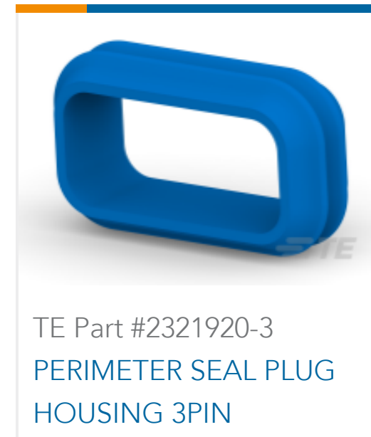
TE Part #2321920-3 PERIMETER SEAL PLUG HOUSING 3PIN