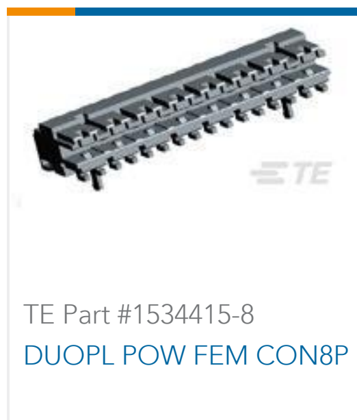
TE Part #1534415-8 DUOPL POW FEM CON8P