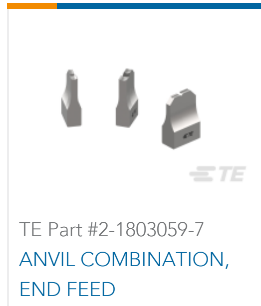
TE Part #2-1803059-7 ANVIL COMBINATION, END FEED