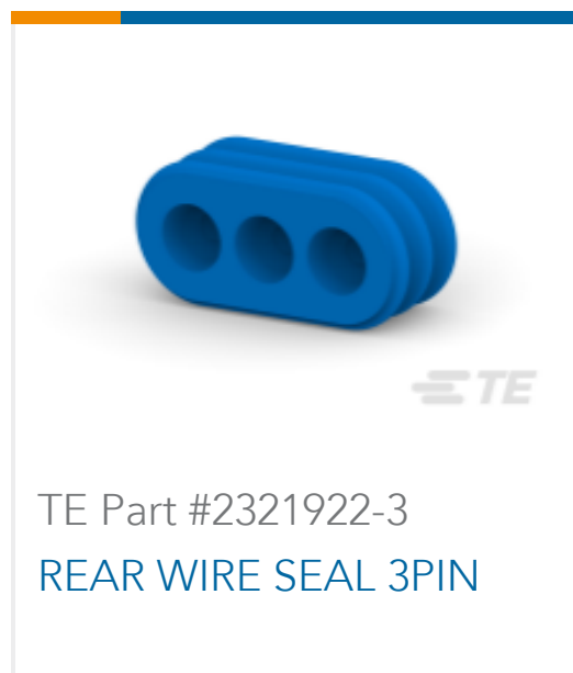
TE Part #2321922-3 REAR WIRE SEAL 3PIN