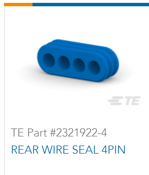
TE Part #2321922-4 REAR WIRE SEAL 4PIN