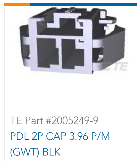
TE Part #2005249-9 PDL 2P CAP 3.96 P/M (GWT) BLK