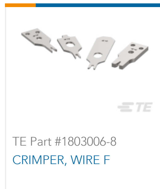
TE Part #1803006-8 CRIMPER, WIRE F