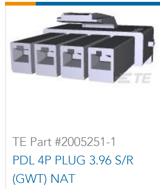
TE Part #2005251-1 PDL 4P PLUG 3.96 S/R (GWT) NAT