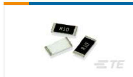
TE Part #2176049-5 RLP73M 1E R075 1% 1K RL