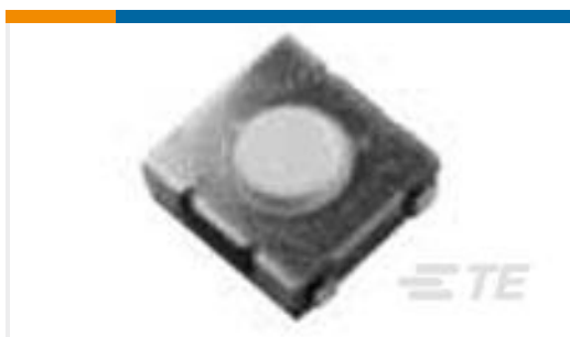
TE Part #1571625-1 TACT,6X6,SMT,J-LEAD, 50GF