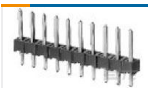
TE Part #5-146292-4 04 MODII HDR SRST B/A 100 W/HD