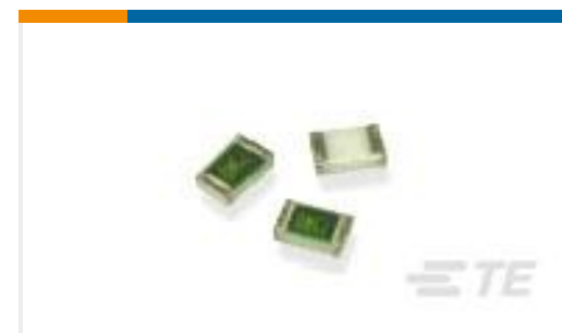
TE Part #4-2176092-8 RP 2A 0.25W 2K32 0.1% 25PPM 1K RL