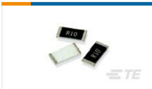
TE Part #3-2176058-2 RLP73K 3A R20 5% 2K RL