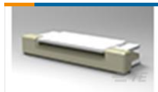
TE Part #1734839-9 FPC CONN. 0.5MM PITCH T/C, 9P