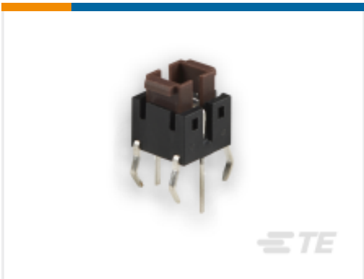
TE Part #4-2213818-5 6X6 ILL TACT THT 260GF HI SOFT ORANGE