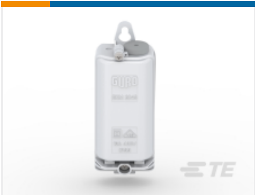
TE Part #522334-000 EKM-2045-1D1-4-E41