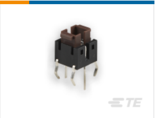
TE Part #1-2213818-7 6X6 ILL TACT THT 160GF LI BLUE