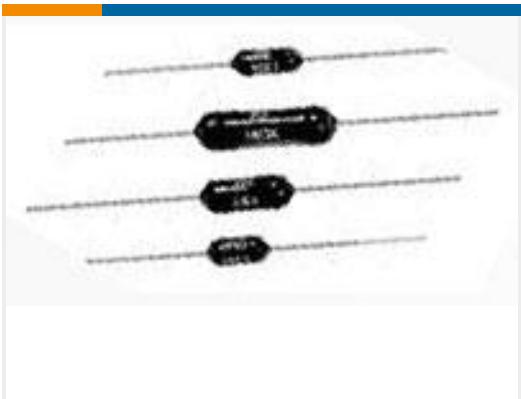
TE Part #2-1879642-5 H8 2K5 0.1% 50PPM