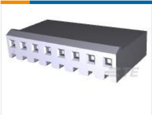
TE Part #770696-8 08P SL156 HSG W/LCK RAMP NATL