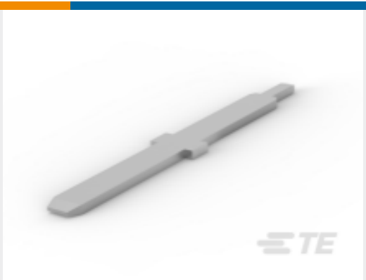
TE Part #969207-2 FLA-STE-KONT2,8X0,8