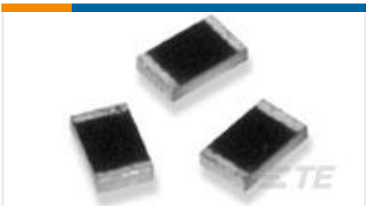
TE Part #2-1879264-0 RP 2B 73K2 0.1% 15PPM 1K RL