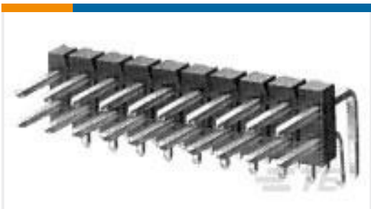
TE Part #1-103149-7 34 MODII HDR DRRA B/A . 100CL