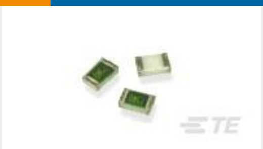
TE Part #6-1879128-5 RN 0402 909R 0.1% 10PPM 1K RL