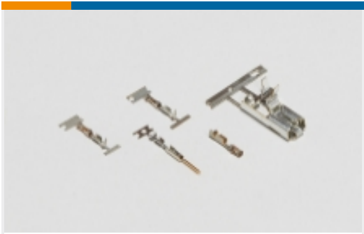
Wire-to-Board Connector Contacts(6)