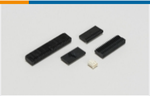
Wire-to-Board Connector Housings(102)