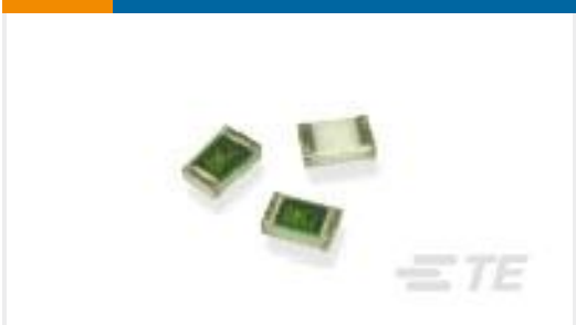
TE Part #1-1879129-4 RN 0402 1K33 0.1% 10PPM 1K RL