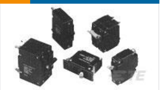
TE Part #3-1393253-0 W68-X2Q12-10V=M6/M7 /M9/W6/W7