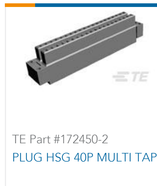
TE Part #172450-2 PLUG HSG 40P MULTI TAP