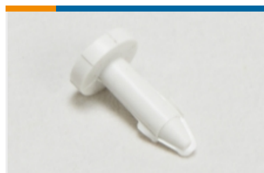
D-Sub Contact Accessories (1)