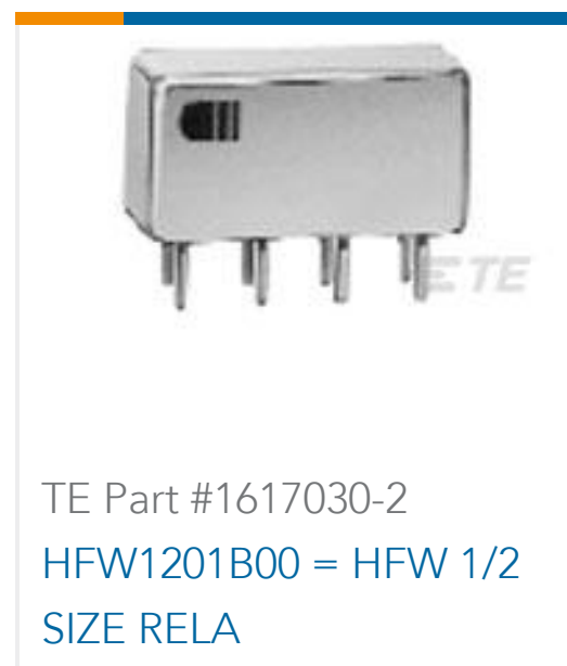
TE Part #1617030-2 HFW1201B00 = HFW 1/2 SIZE RELA