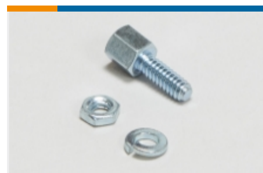
D-Sub Locking & Mounting (122)