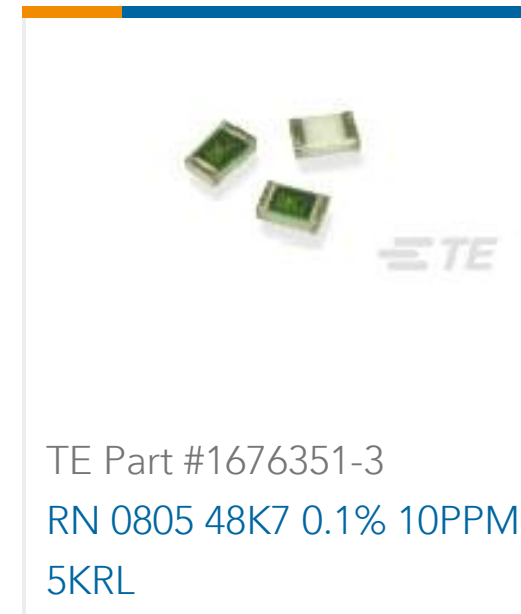
TE Part #1676351-3 RN 0805 48K7 0.1% 10PPM 5KRL