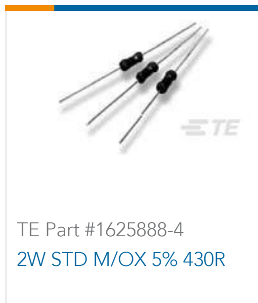
TE Part #1625888-4 2W STD M/OX 5% 430R