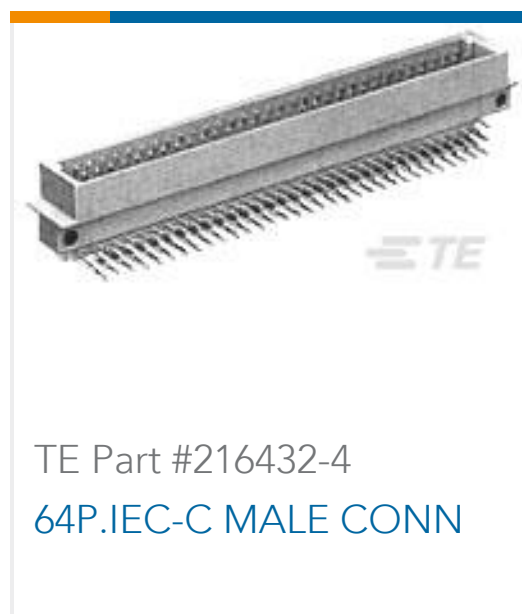
TE Part #216432-4 64P.IEC-C MALE CONN