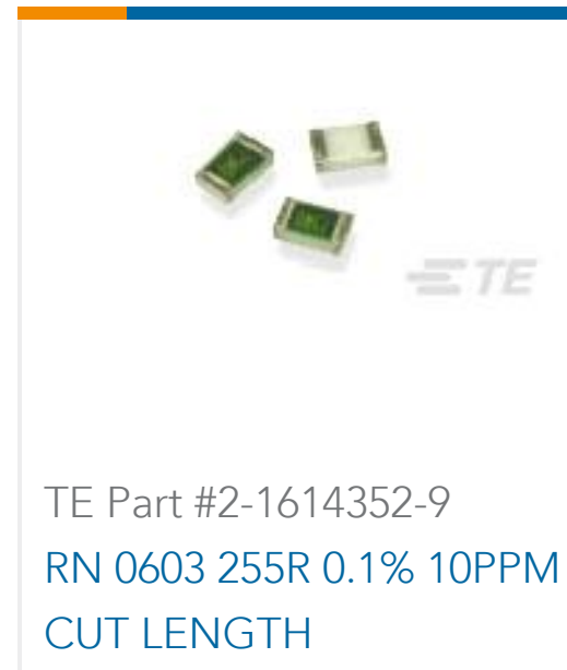
TE Part #2-1614352-9 RN 0603 255R 0.1% 10PPM CUT LENGTH