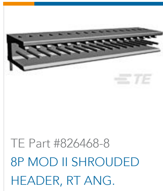
TE Part #826468-8 8P MOD II SHROUDED HEADER, RT ANG.