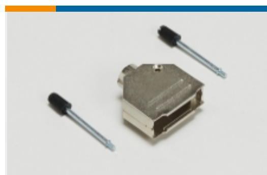
D-Sub Backshells & Clamps (140)