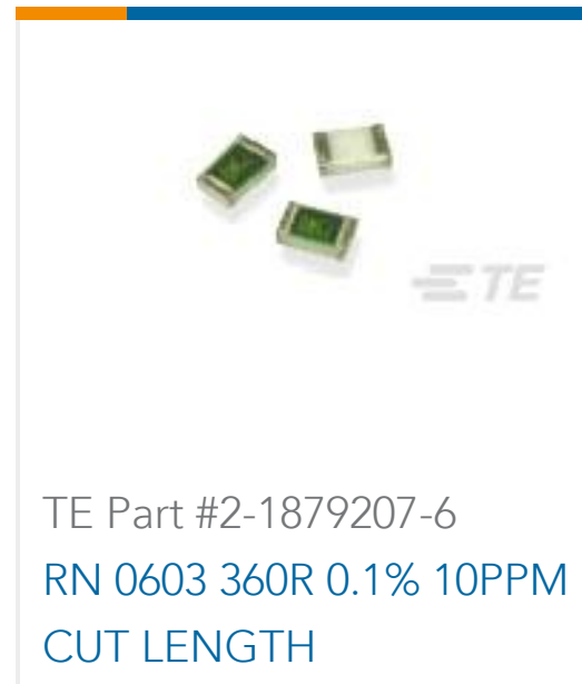
TE Part #2-1879207-6 RN 0603 360R 0.1% 10PPM CUT LENGTH