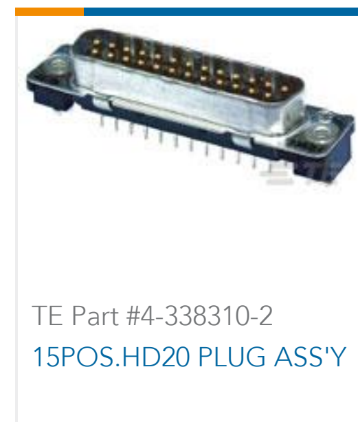
TE Part #4-338310-2 15POS.HD20 PLUG ASS'Y