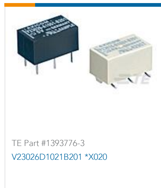
TE Part #1393776-3 V23026D1021B201 *X020