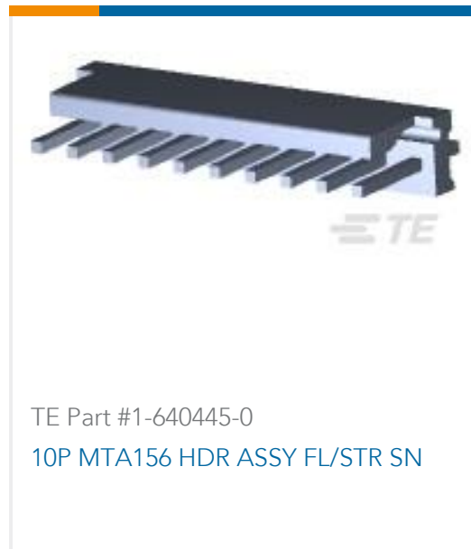
TE Part #1-640445-0 10P MTA156 HDR ASSY FL/STR SN