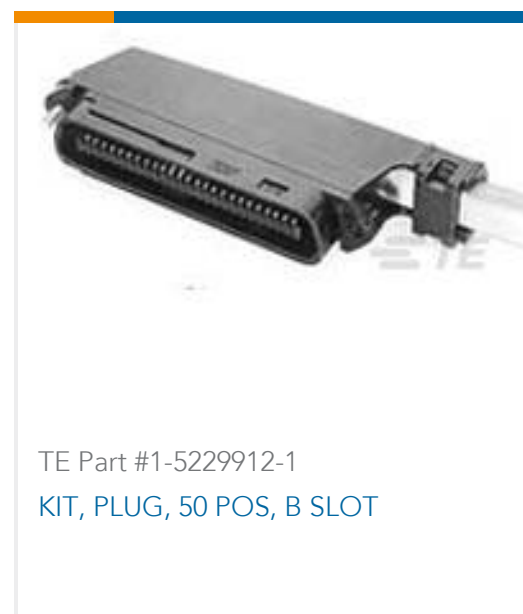
TE Part #1-5229912-1 KIT, PLUG, 50 POS, B SLOT