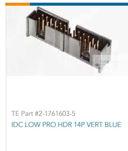
TE Part #2-1761603-5 IDC LOW PRO HDR 14P VERT BLUE