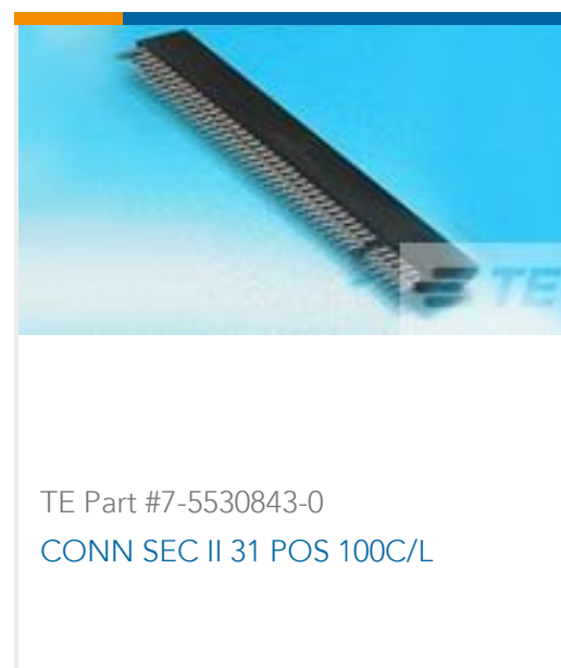
TE Part #7-5530843-0 CONN SEC II 31 POS 100C/L