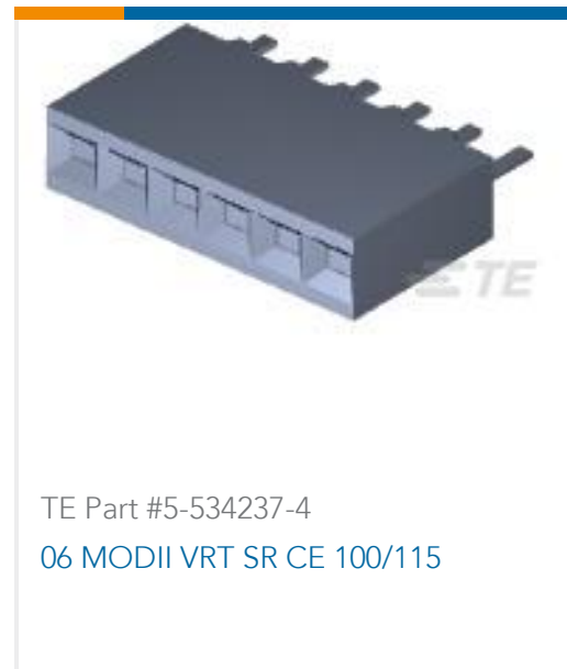
TE Part #5-534237-4 06 MODII VRT SR CE 100/115