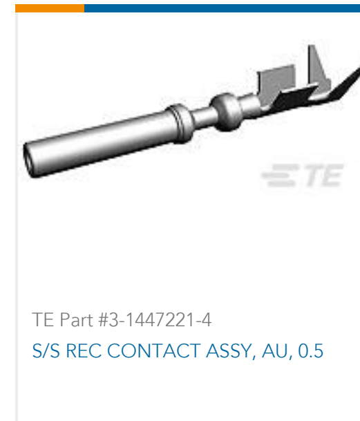
TE Part #3-1447221-4 S/S REC CONTACT ASSY, AU, 0.5