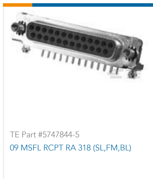
TE Part #5747844-5 09 MSFL RCPT RA 318 (SL,FM,BL)