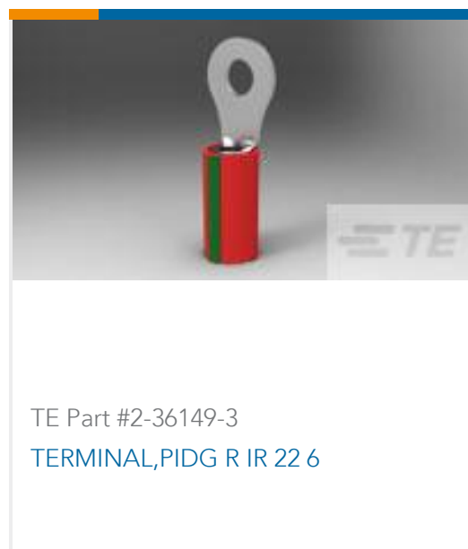
TE Part #2-36149-3 TERMINAL,PIDG R IR 22 6