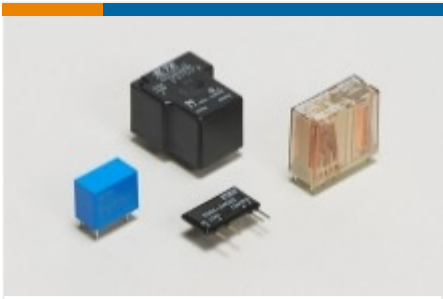
Power Relays (8)