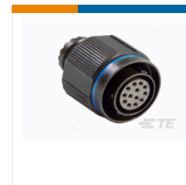
PLUG ASSY DTS26F11-98SA [V001]