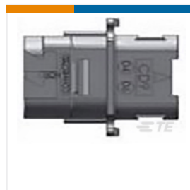
DMC-MD 26 A DMC-MD 26 A