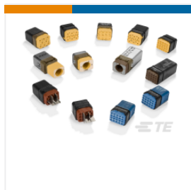
DMC-M 99-01 SN DMC-M 99-01 SN