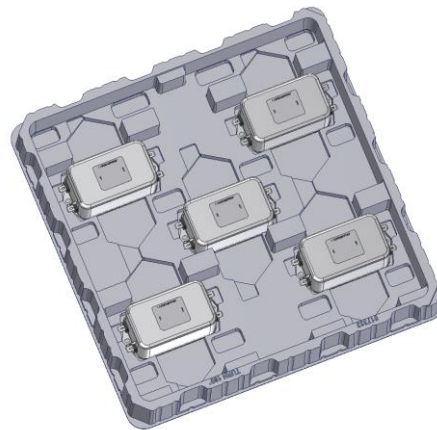
Figure 2: Example of new tray