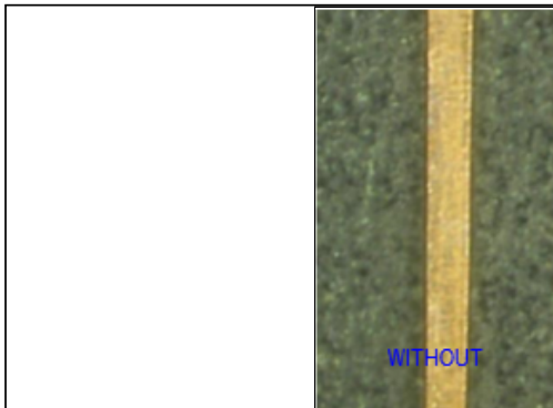
EXISTING PIN WITHOUT COIN

CUSTOMER CAN SEE WHAT APPEARS TO BE A SCRIBE LINE DOWN THE LENGTH OF THE TAIL ON ONE SIDE