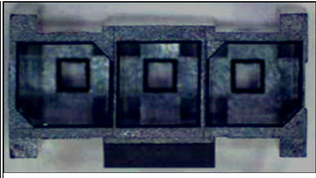
New Part Without Ribs.