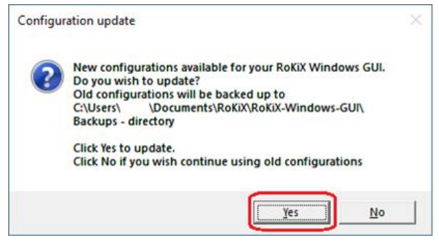
Figure 1. Configuration update pop-up window

Start RoKiX Windows GUI. If Configuration update pop-up window is shown, click Yes to download the latest configurations from the server.