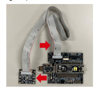
Direct Ribbon cable Figure 2. KX134-1211-EVK-001 connection

Connect the CY8CKIT-059 to the PC using the provided micro-USB cable to establish the connection with RoKiX Windows GUI.