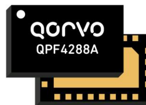
24 Pad 5 x 3 mm Laminate Package