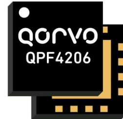
16 Pin 3x3 mm Laminate Package

The QPF4206 integrates a 2GHz power amplifier (PA), regulator, single pole two throw switch (SP2T), and a bypassable low noise amplifier (LNA).