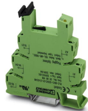
Figure shows PLC-BSC-120UC/21-21/SO46 version

http://catalog.phoenixcontact.net/phoenix/treeViewClick.do?UID=2967044