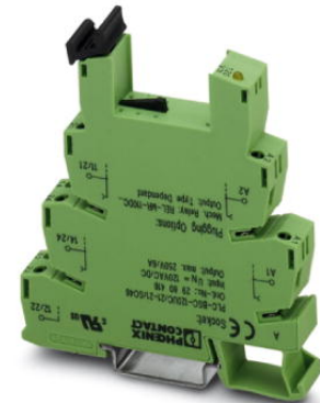
Figure shows PLC-BSC-120UC/21-21/SO46 version

http://catalog.phoenixcontact.net/phoenix/treeViewClick.do?UID=2967015