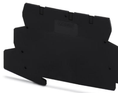
Illustration shows the black product version

http://catalog.phoenixcontact.net/phoenix/treeViewClick.do?UID=2856773