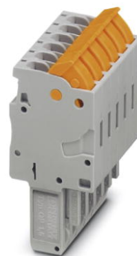
Illustration shows the product version QP 1,5/ 6

http://catalog.phoenixcontact.net/phoenix/treeViewClick.do?UID=3051195