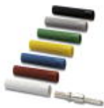
Insulating sleeve, Color: white