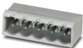
The figure shows a 5-pos. version of the product

Header, Nominal current: 12 A, Rated voltage (III/2): 320 V, Number of positions: 3, Pitch: 5.08 mm, Color: signal grey, Contact surface: Tin, Assembly: Soldering