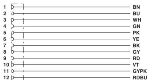
Contact assignment of the M12 socket