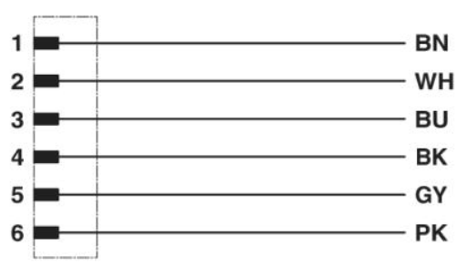
Contact assignment of the M8 plug