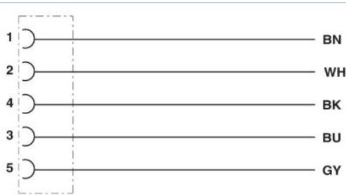
Contact assignment of the M12 socket