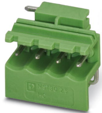
Illustration shows different articles for putting together the upper part of the housing

http://eshop.phoenixcontact.de/phoenix/treeViewClick.do?UID=1861060