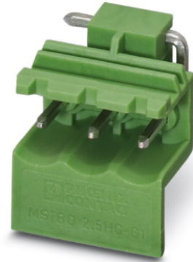
Illustration shows different articles for putting together the upper part of the housing

http://eshop.phoenixcontact.de/phoenix/treeViewClick.do?UID=1861028