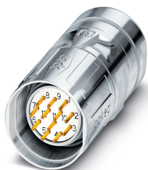
Cable connector, CA, straight, shielded: yes, SPEEDCON locking, M23, No. of pos.: 17, type of contact: Pin, Solder connection, cable diameter range: 3 mm ... 14.5 mm, coding:N

Please be informed that the data shown in this PDF Document is generated from our Online Catalog. Please find the complete data in the user's documentation. Our General Terms of Use for Downloads are valid ( http://phoenixcontact.com/download )