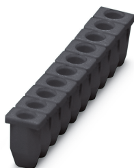
Insulating sleeve, color: black

Please be informed that the data shown in this PDF Document is generated from our Online Catalog. Please find the complete data in the user's documentation. Our General Terms of Use for Downloads are valid ( http://phoenixcontact.com/download )