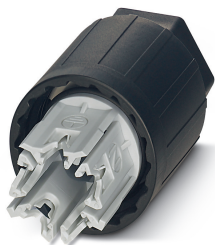
QUICKON nut, black, 4+PE-pos., 1.0 mm 2 ... 2.5 mm 2 /690 V/20 A, for cables with 9 mm ... 16 mm diameter.

Please be informed that the data shown in this PDF Document is generated from our Online Catalog. Please find the complete data in the user's documentation. Our General Terms of Use for Downloads are valid ( http://phoenixcontact.com/download )