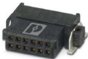
The figure shows a 12-pos. version with 12 contacts

SMD female connector, Nominal current at 20 °C: 1.4 A, Test voltage: 500 V AC, number of positions: 50, pitch: 1.27 mm, color: black, contact surface: Gold, mounting: SMD soldering