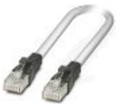
Patch cable, CAT5, assembled, 5 m

Patch cable - FL CAT5 PATCH 5,0 - 2832580