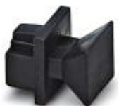
Dust protection caps for RJ45 socket

Dust protection - FL RJ45 PROTECT CAP - 2832991