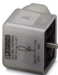
Valve connectors, 3-position, Valve connector A, with 1 LED, Screw connection, cable gland Pg9, external cable diameter 6 mm ... 8 mm

Please be informed that the data shown in this PDF Document is generated from our Online Catalog. Please find the complete data in the user's documentation. Our General Terms of Use for Downloads are valid ( http://phoenixcontact.com/download )