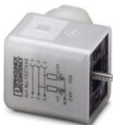
Valve connectors, 5-position, Valve connector AD (pressure switch), with 2 LEDs, Screw connection, cable gland Pg9, external cable diameter 6 mm ... 8 mm

Please be informed that the data shown in this PDF Document is generated from our Online Catalog. Please find the complete data in the user's documentation. Our General Terms of Use for Downloads are valid ( http://phoenixcontact.com/download )