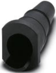
Bend protection sleeve, for cable diameter of 3 mm ... 9 mm, diameter: 12 mm, color: black

Please be informed that the data shown in this PDF Document is generated from our Online Catalog. Please find the complete data in the user's documentation. Our General Terms of Use for Downloads are valid ( http://phoenixcontact.com/download )