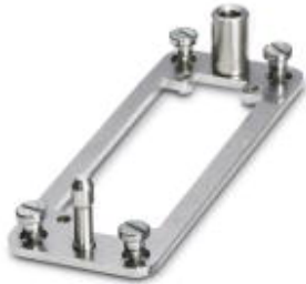
Docking frame for racks, for contact inserts of B24 type, with four M5 flat headed screws, rack balance x/y axis +/- 1.5 mm

Please be informed that the data shown in this PDF Document is generated from our Online Catalog. Please find the complete data in the user's documentation. Our General Terms of Use for Downloads are valid ( http://phoenixcontact.com/download )