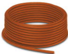
Cable ring, PUR halogen-free irradiated orange, 4-pos., conductor colors: Brown / white / blue / black, cable length: 100 m

Please be informed that the data shown in this PDF Document is generated from our Online Catalog. Please find the complete data in the user's documentation. Our General Terms of Use for Downloads are valid ( http://phoenixcontact.com/download )