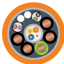
Cable cross section