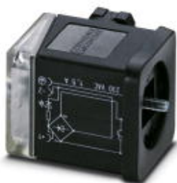
Valve connectors, 3-position, Valve connector A, with 1 LED, connected with Varistor and rectifier, Screw connection, cable gland M16, external cable diameter 6 mm ... 8 mm

Please be informed that the data shown in this PDF Document is generated from our Online Catalog. Please find the complete data in the user's documentation. Our General Terms of Use for Downloads are valid ( http://phoenixcontact.com/download )