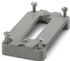
D-SUB adapter plate, for one D-SUB connector, no. of positions 25, housing series HC-B 10...

Please be informed that the data shown in this PDF Document is generated from our Online Catalog. Please find the complete data in the user's documentation. Our General Terms of Use for Downloads are valid ( http://phoenixcontact.com/download )