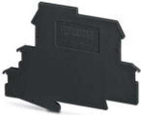
End cover for TERMITRAB TT-2-PE-M-... and TT-2/2-M-...

Please be informed that the data shown in this PDF Document is generated from our Online Catalog. Please find the complete data in the user's documentation. Our General Terms of Use for Downloads are valid ( http://phoenixcontact.com/download )